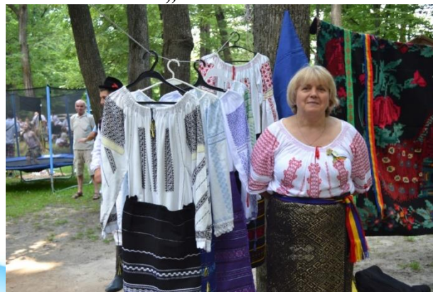
International Festival of Music and Poetry „Eminesciana”