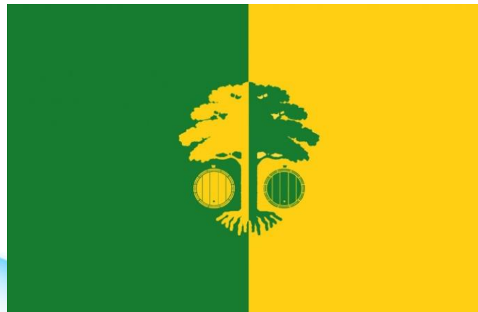
The flag of Strășeni District