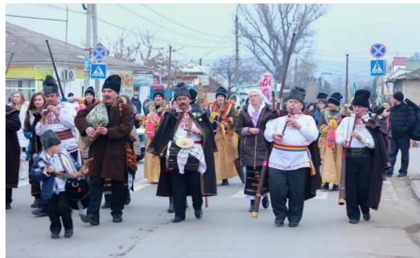
International Folklore Festival „Cântec, Joc și Voie Bună”