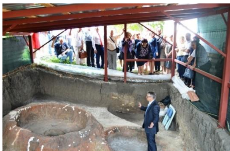
Pottery and Cristian necropole Workshop from the „Golden Horde” Age