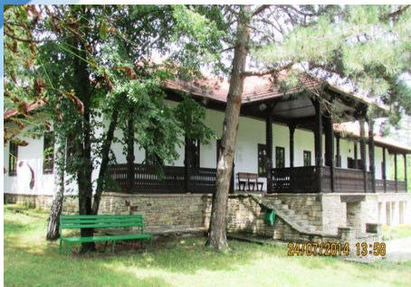
Ralli Manor House —A. S. Puşkin Museum, Dolna village