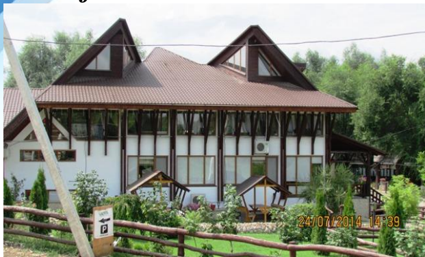
„La Bădiș” Restaurant