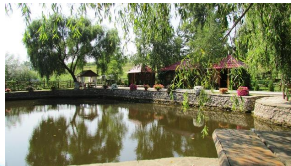
„Lacul verde” LLC