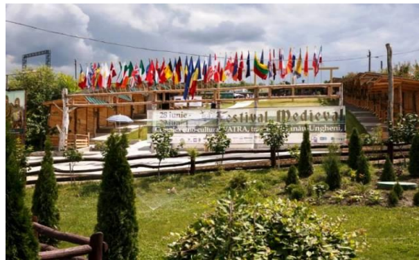
Ethno –Cultural Complex ”VATRA”