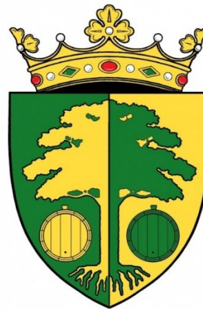
The coat of arms of Strășeni