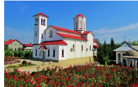
„Mucenic Iacov Persul”, Monastery, Sireți village