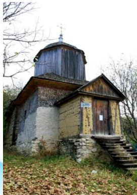
Wooden Church, Vorniceni village